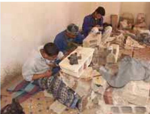
Artisans of typical ceramic "Zellige Beldi"

The prospect is to reach a regeneration of all the district, starting by a pilot-intervention, to make the population aware of the problems of heritage preservation: in fact the strategy of the project tries to involve the local inhabitants by the organization of training courses for the young unemployed of the district (starting from the artisans of ceramics, of bricks and wrought iron that are now working at the restoration of the Maison Sinaceur ).