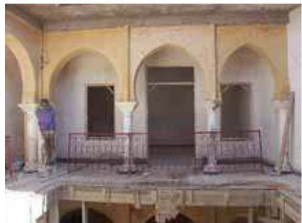
The restoration of the Maison Sinaceur

For a better accessibility to the complex it has been studied an urban project, with the prevision of opening new entrances to the area, that will be completely paved and equipped with a green space and a new small square.