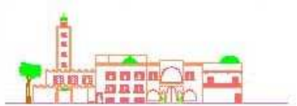
Main front of the Cultural complex

The intervention area is located in the northern part of the Medina, in the district of Derb Senia , and the block area is about of 1.300 m 2 ; it includes a small mosque that will be completely transformed, with the help of the Ministry of Religious Affairs.