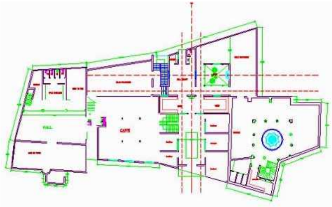
Ground level plan